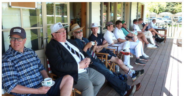
▲ Dilmah time for the Otago Boys' High School 'brains trust'.