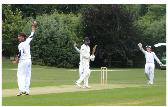
Confident Nelson appeal – not given!