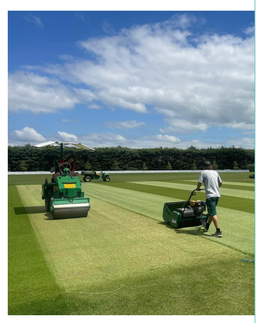
Pitch preparation in January 2023.

Those cricketers who have entered their 30s and beyond have other opportunities, in competitions such as the Kindred and Chatfield Cups, and provincial and international over 50s, 60s, 70s etc. (I have not traced the over 80s yet). Keeping Willowers in the game is important to the Club's objectives, and the Kindred Cup is a big part of this. The tournament was played in the New Year with The Willows aiming for a fourth successive title. After good wins over the host North Shore and Clifton (Hawkes Bay), we fell in the final to Seddon, who were deserving winners.