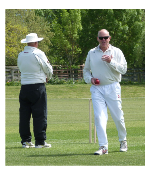
What's Nutts conjuring up now?