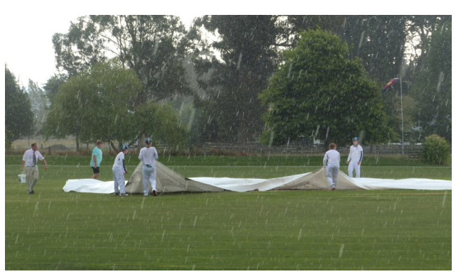
More than just a light shower!