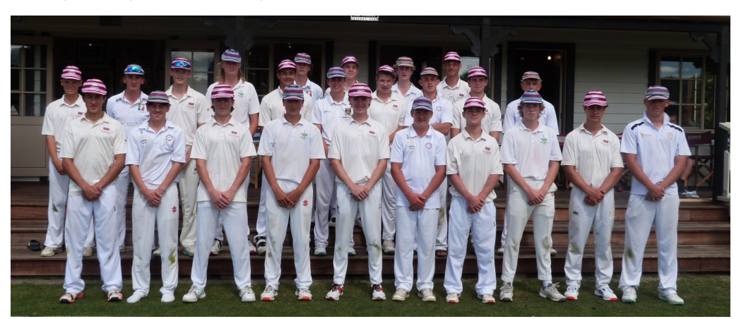
The Seddon CC and Willows U-17 Youth XIs.