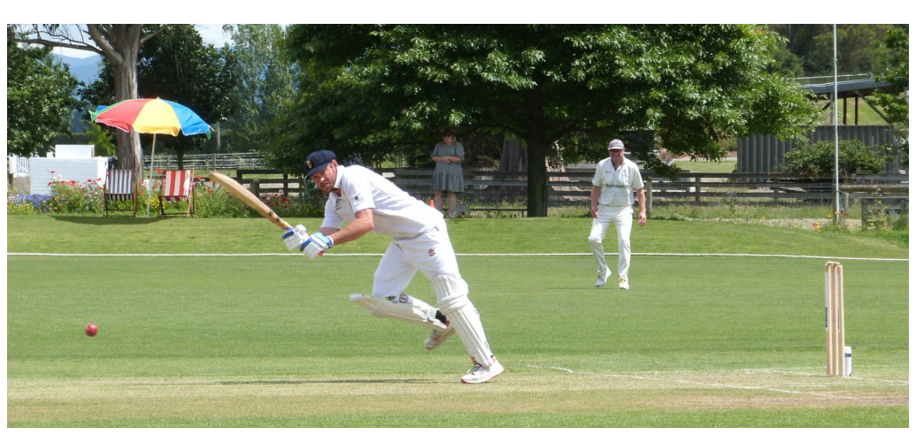
Worked stylishly to leg.