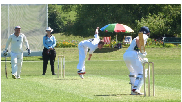
Beautiful setting with blooms on the new embankment.