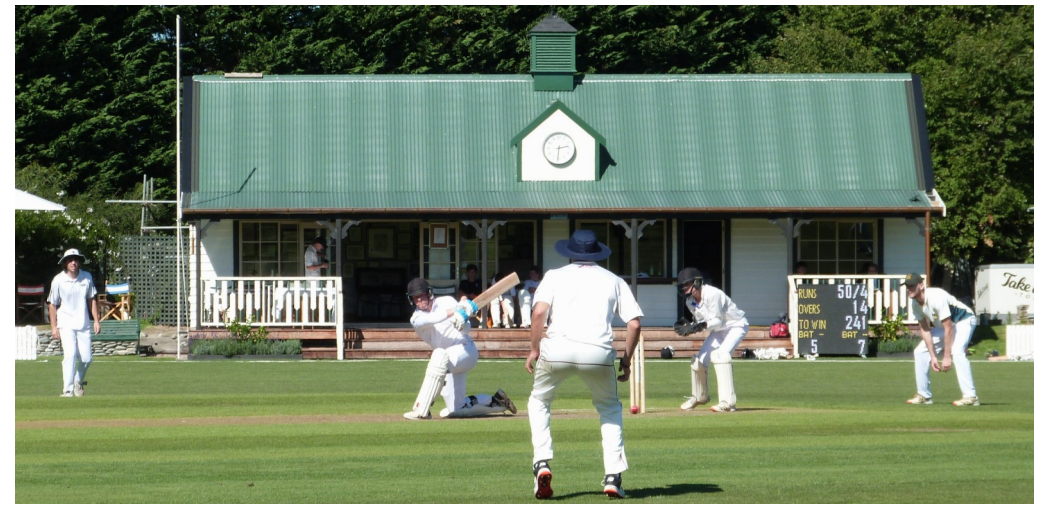
▲ Whanganui Collegiate in trouble chasing 241.