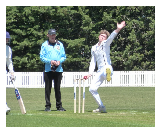
Peninsula Craz opening bowler lets one rip.