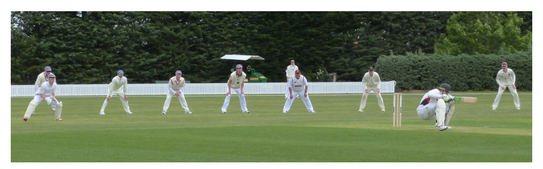
All out attack against Ashburton College 1st XI on Sunday 6th November 2022.