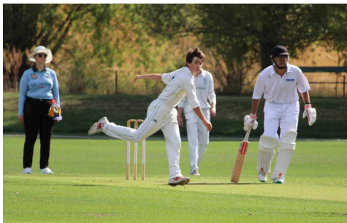
▲ A lively SBHS seamer.

a six over midwicket. Shirley Boys' High School were all out in the 50th over for 206. They acquitted themselves well, looked fantastic and totally entered into the spirit of the day.