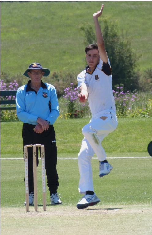
▲ One of several tall young quicks in the Marlborough side.