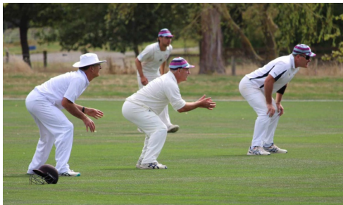
▲ The Willows' cordon fully focused.