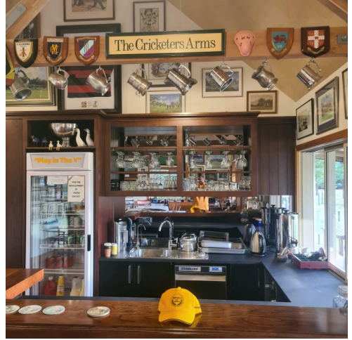
▲ The refurbished Cricketers Arms.