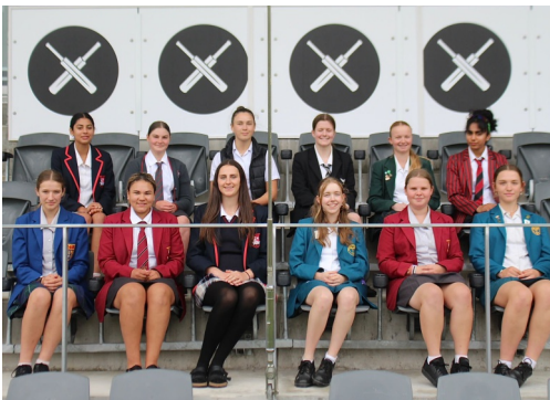
▲ Wellington Wanderers XI at the Basin Reserve.