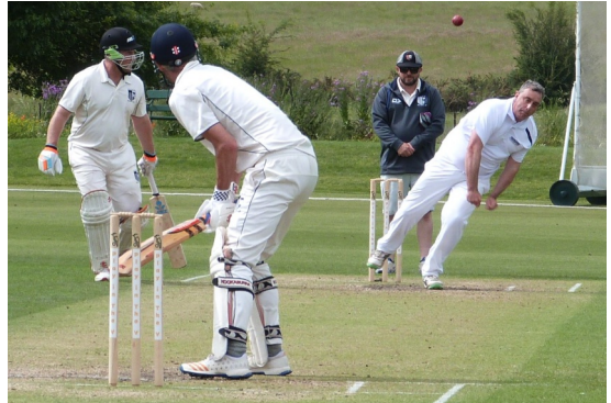
▲ Wicket ball