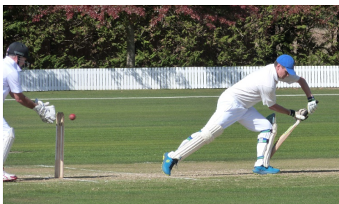
▲ A chance for the gloveman.