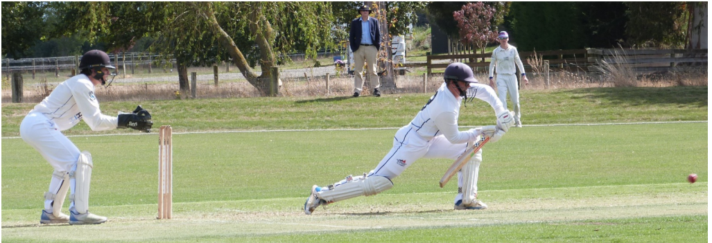
▲ Straight from the coaching manual.