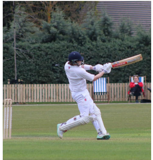
▲ OBHS on the attack.