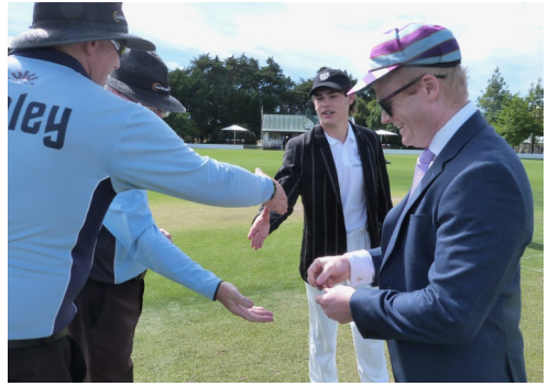
▲ Crucial coin toss.