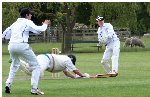
▲ The Willows survive a tense moment in the chase.