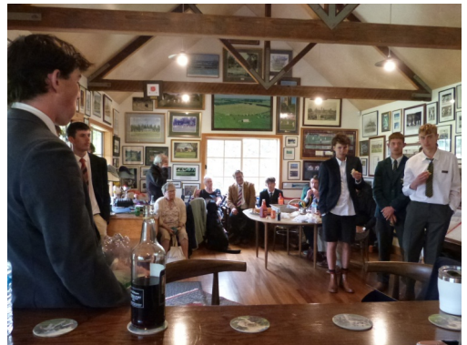
▲ Post-match indoors.