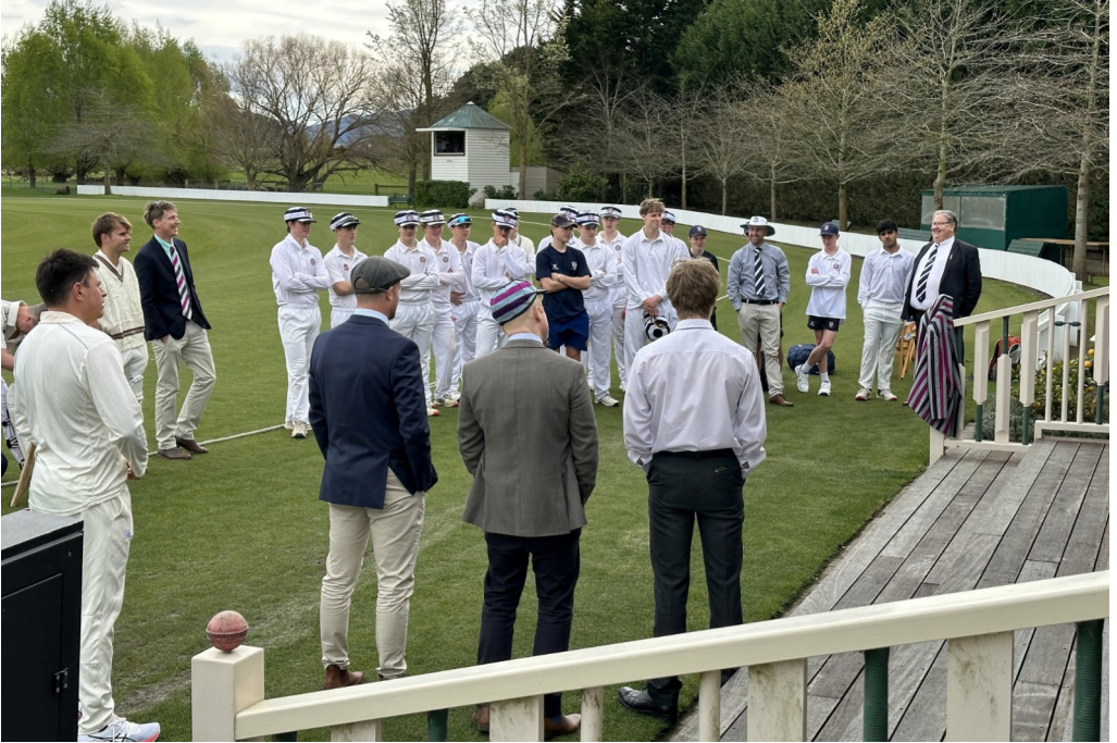
▲ The Willows v Otago Boys' High School post-match.