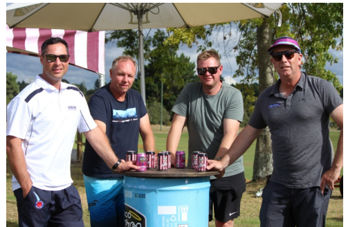
▲ Willowers in Taupo for the Kindred tournament.

This Willows Kindred team is highly successful, and I have backed it strongly, as it allows strong competition and wonderful camaraderie with many Clubs of shared values. It is a very important part of the Club's makeup, keeping Willowers in the game, as several have told me.