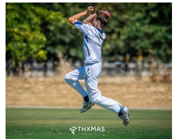
▲ Photos from the Nelson College match