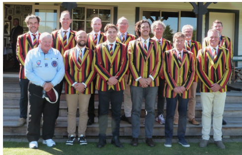
▲ I Zingari Australia.