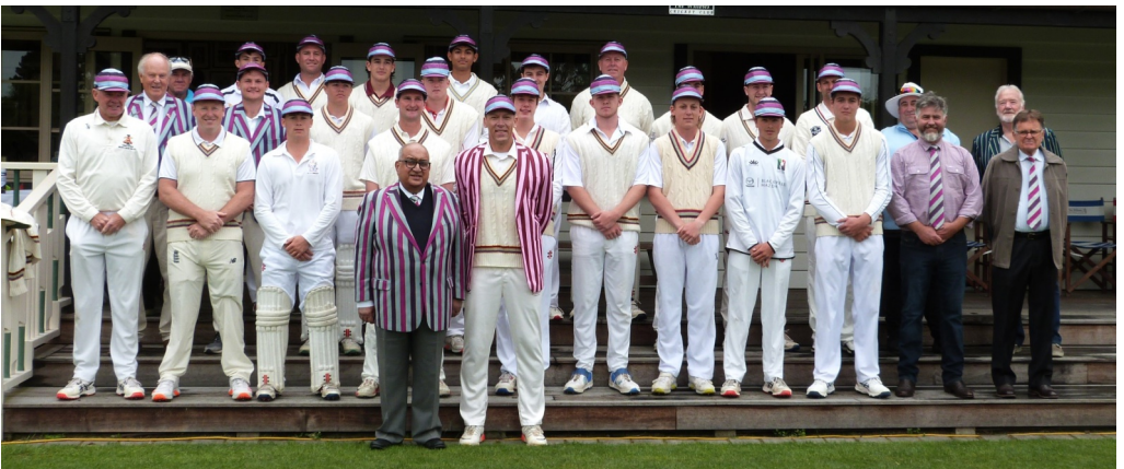
▲ Players and guests gather before The Willows President's XI v Willows Youth XI match on Sunday 10th December.