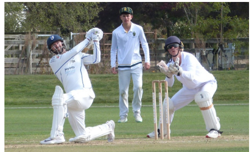
▲ Another expansive shot.