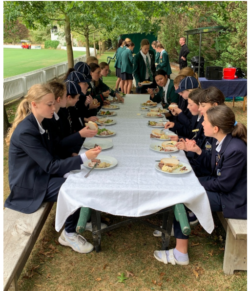
▲ OGHS and St Margaret's teams at lunch.