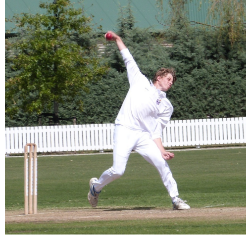
▲ A visiting legspin exponent.