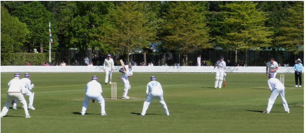
▲ The Willows on the attack against the Mid Canterbury XI on 29th October.