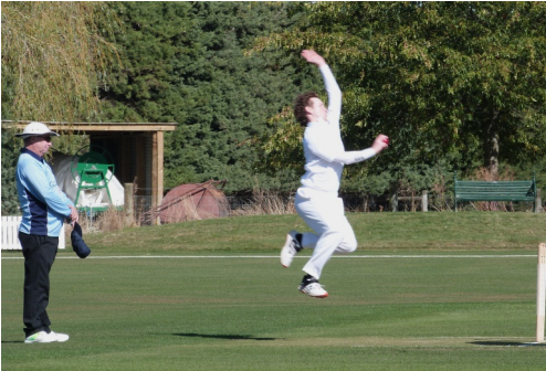
▲ High bounding country quick.