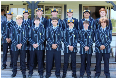
▲ The Shirley Boys' High School 1st XI.