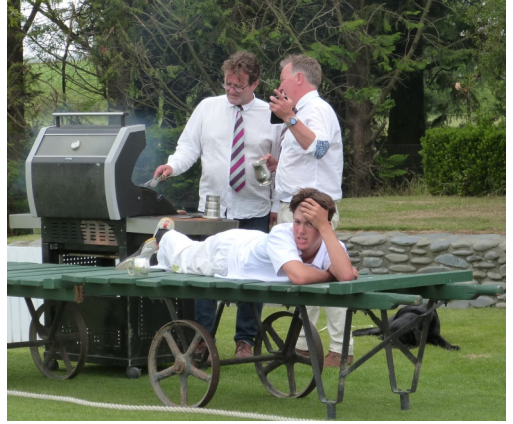
▲ Men at work – post-match preparation.