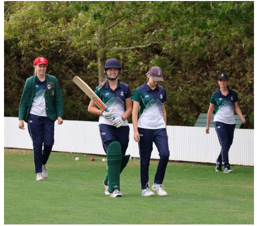
▲ St Margaret's College players warming up before their match against Otago Girls' High School.