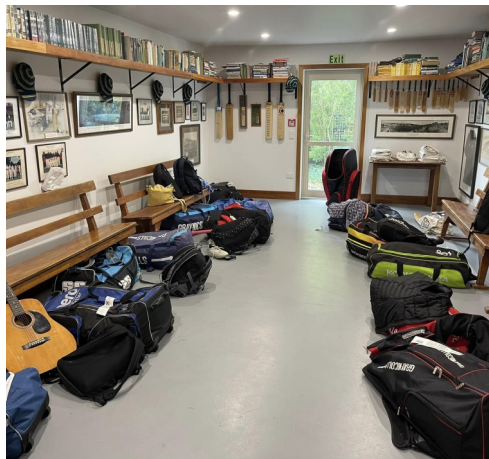
▲ The Don Neely Changing Room and Library.