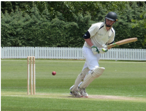
▲ James D'Arcy looking good.