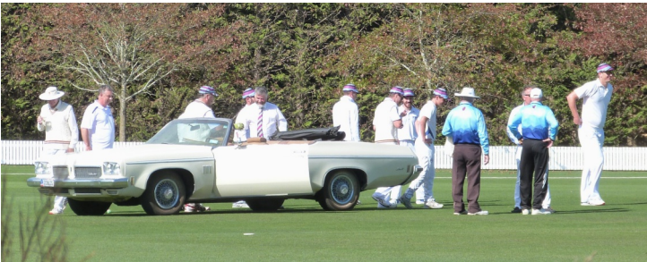
▲ The first time an Oldsmobile Delta Royale has been used as drinks trolley.