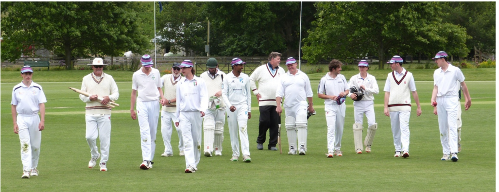
▲ The players head for a well earned post-match drink after The Willows v Development XI match on 3rd December 2023.