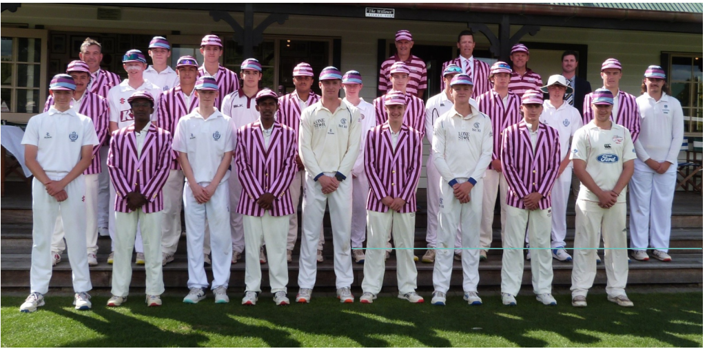
▲ The Willows Development XI hosted Seddon CC in a sea of pink.